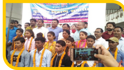
Board Toppers Meet (Rural)