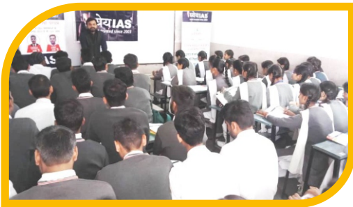
New World Public Inter College, Lucknow