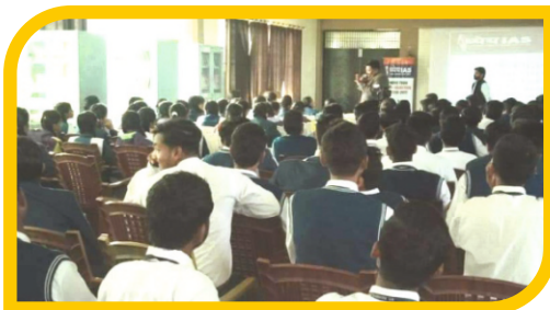
ST.XAVIER'S SCHOOL, BALRAMPUR