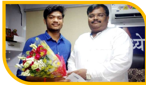
LEADER OF OPPOSITION