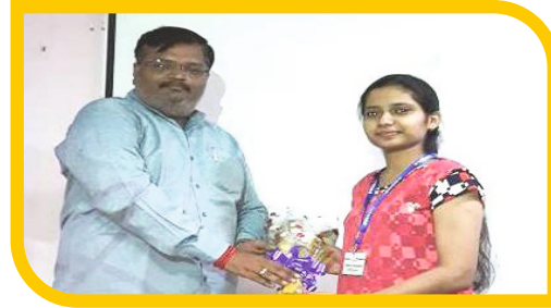
LEADER OF OPPOSITION