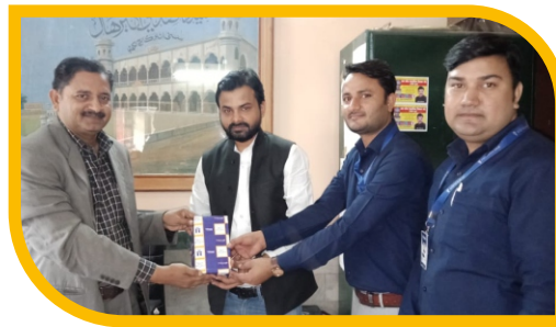
Sunni Inter College, Lucknow