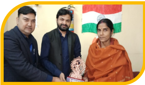
Bright Sun Public Inter College, Lucknow