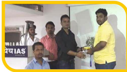
LEADER OF OPPOSITION