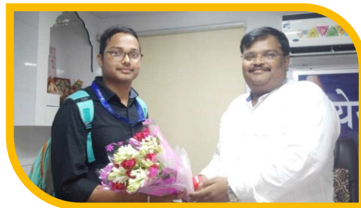
LEADER OF OPPOSITION