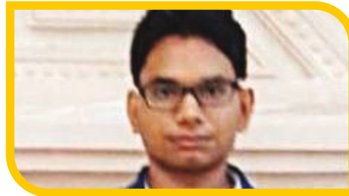
LEADER OF OPPOSITION