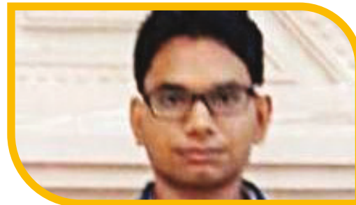
LEADER OF OPPOSITION