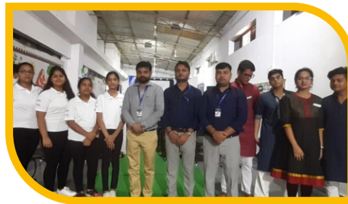
DPS Gomti Nagar, Lucknow