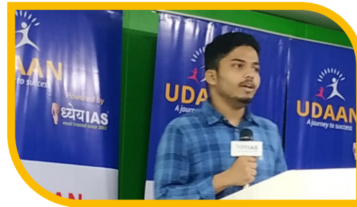
LEADER OF OPPOSITION