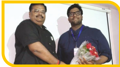
LEADER OF OPPOSITION