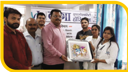
Blood Donation Camp-2019