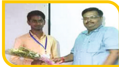
LEADER OF OPPOSITION